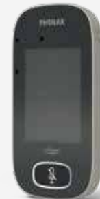
Roger Touchscreen Mic